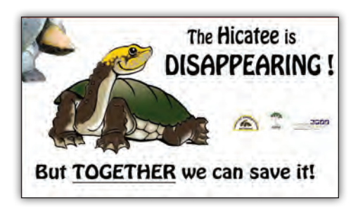
This large 10' x 20' billboard is visible to all drivers leaving Belize City and is seen by those heading north into the Belize river valley, the region of highest Hicatee consumption.

Lee McLoughlin, lee.mcloughlin@yaaxche.org